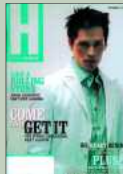
New men's fashion trade title steps out, page 13